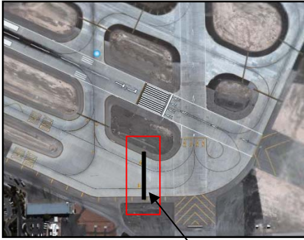
Hold bar for Rwsy 7L / 1R

HS1: Twy E is often misidentified as a Runway, always verify Runway markings prior to departure.