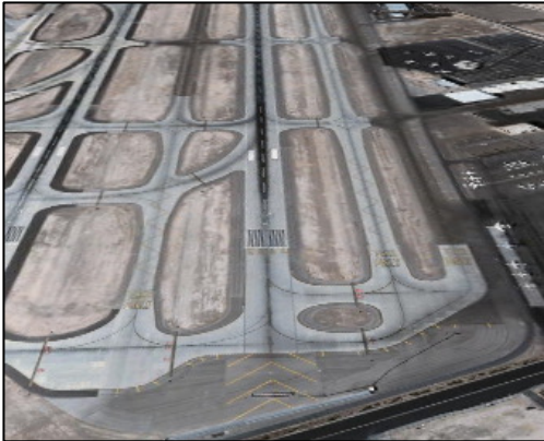
View from short final Rwy 19R